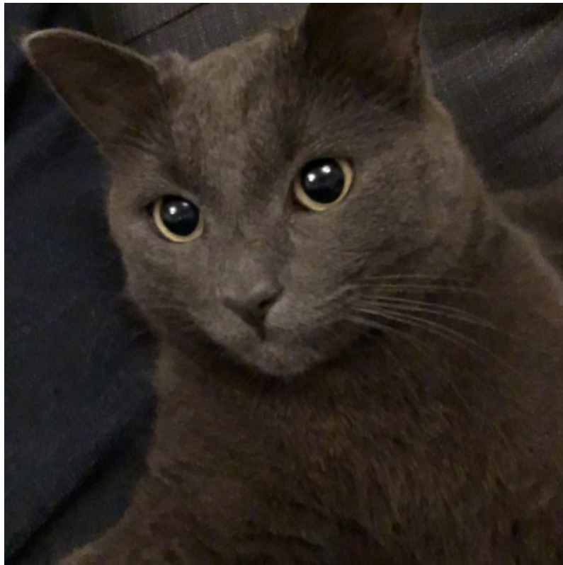
Max the elusive Presbytery cat. Have you spotted him?