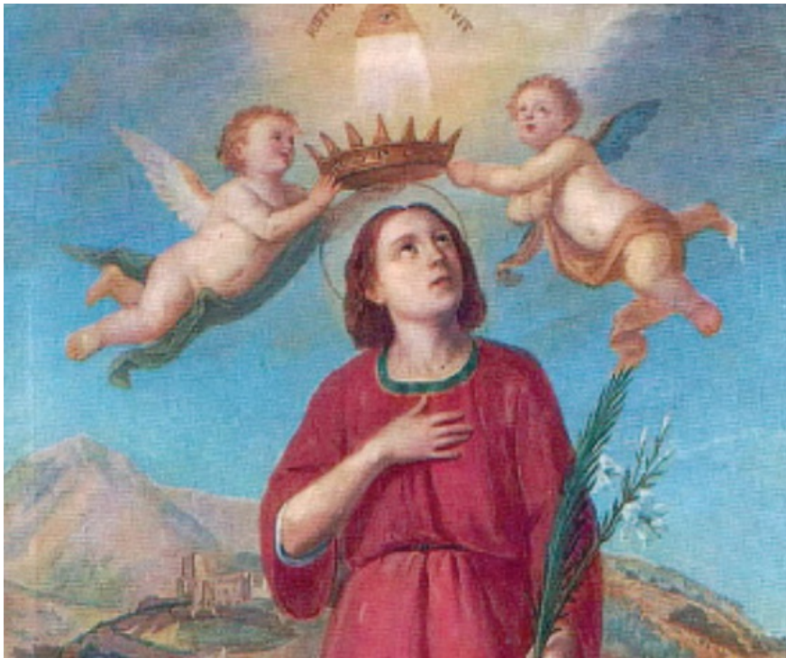
St. Justin, Martyr

St. Justin became a Christian at the age of 30. He was well educated in rhetoric, poetry and history before turning to philosophy. He is regarded as the 2nd century Father of the Church and the first Christian Philosopher.