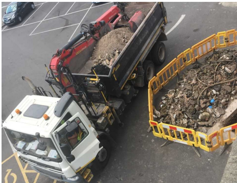
Power failure chaos in our carpark this week!