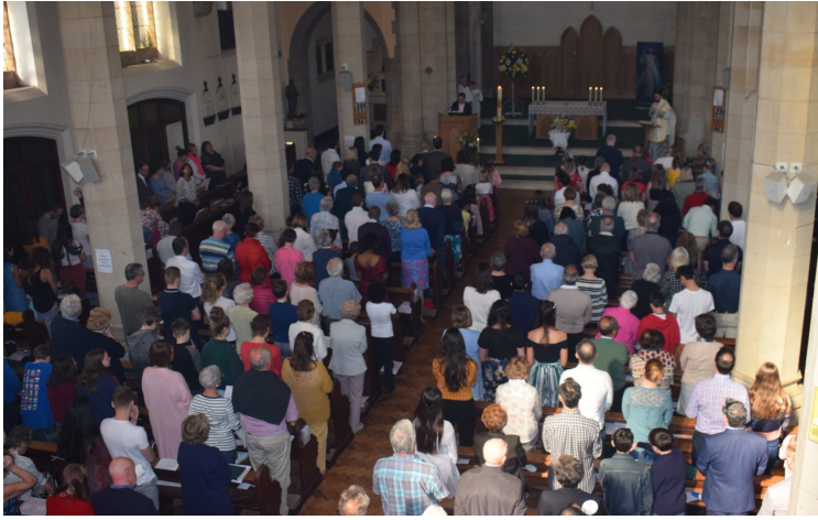
Easter celebrations.